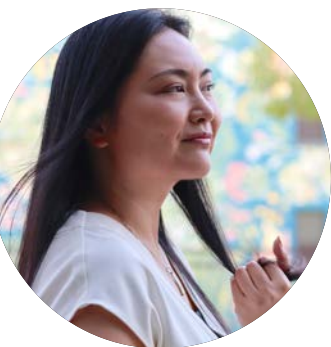
Song Name Sing For You